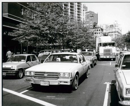
Andy Warhol (American, 1928-87), Cars on the Street, n.d., gelatin silver print © The Andy Warhol Foundation for the Visual Arts, Inc. Union College Permanent Collection, 2008x.9.148 UCPC