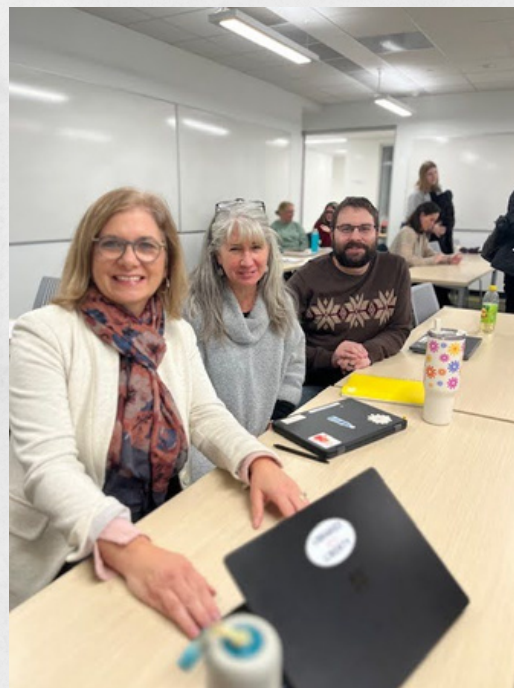
Participants engaging with our research and instruction presentations.

The survey highlighted disconnects between the skills students bring, and the skills they need to succeed at Union. When the results were shared with the CDLC interest group, K12 colleagues expressed a keen interest in learning more. They asked if we could host a retreat where we demonstrate research instruction in college, and then discuss in person how we can support students' research skills.