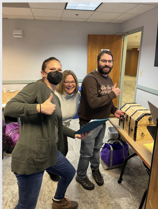
The winning escape room group!

Twenty three people signed up for the event, with 22 attending, representing high school libraries, college libraries, library systems, and high school disciplinary classrooms.